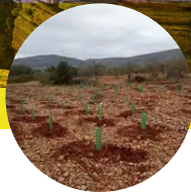
Forestry restauration and creation of a forestry carbon sink Dos Aguas, València