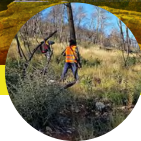
Eurofred Forest Artana, Castellón