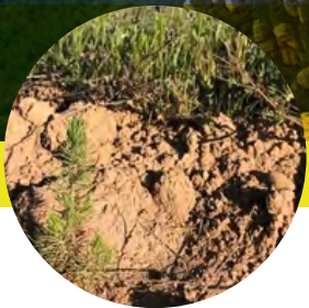
Reforestation on mount "La Capellanía" Venta del moro, València